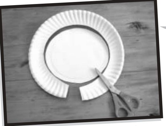
1. Cut the rim off the paper plate, keeping the rim in one piece.

A white paper plate, scissors, pencil, stapler, short piece of string, black waterproof koki-pen, ruler, and green and brown paint.